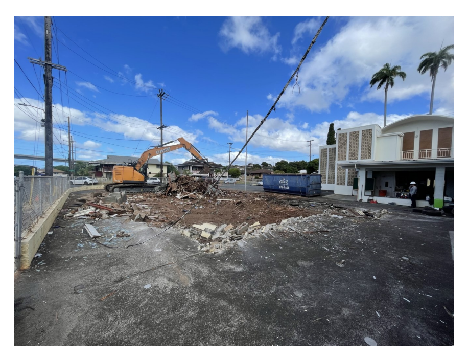
Making way for the new Activity Center